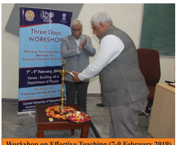
Workshop on Effective Teaching (7-9 February 2019)

The Central University of Rajasthan (CURaj) was established in 2009 by an Act of Parliament as a new Central University, and is fully funded by the Government of India. In order to meet the challenges of the knowledge era and to keep pace with the knowledge explosion in Higher Education, the Central University of Rajasthan is committed to inculcating and sustaining quality in all the dimensions of Higher Education viz. teaching, learning, research, extension and governance while catering to the regional and global needs. CURaj offers more than 70 Masters and PhD programmes in its 29 departments. CURaj is ranked 34 by NIRF, the best among the universities established in 2009 or later and accredited 'A' grade by NAAC and recently selected to be an aspiring applicant for the Institute of Eminence by MHRD, Government of India. CURaj has been granted more than 100 national/international research projects amounting more than Rs. 27 Crores. The University operates from its permanent campus of 550 acres (approx.) and it has adequate hostels housing nearly 1700 students in the campus.