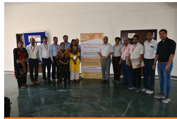
'Four Weeks Induction Training Program' for the Faculty Members of HEIs from 27th May to 22nd June 2019.

Branch Code : 006667 IFSC Code : BKID0006667