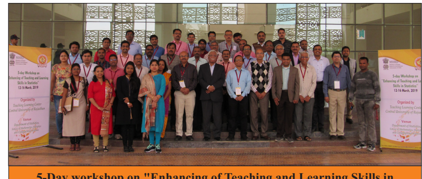
5-Day workshop on "Enhancing of Teaching and Learning Skills in Statistics" for College/University teachers from 12th -16th March, 2019

Eminent speakers from reputed national institutions will deliver the lectures.