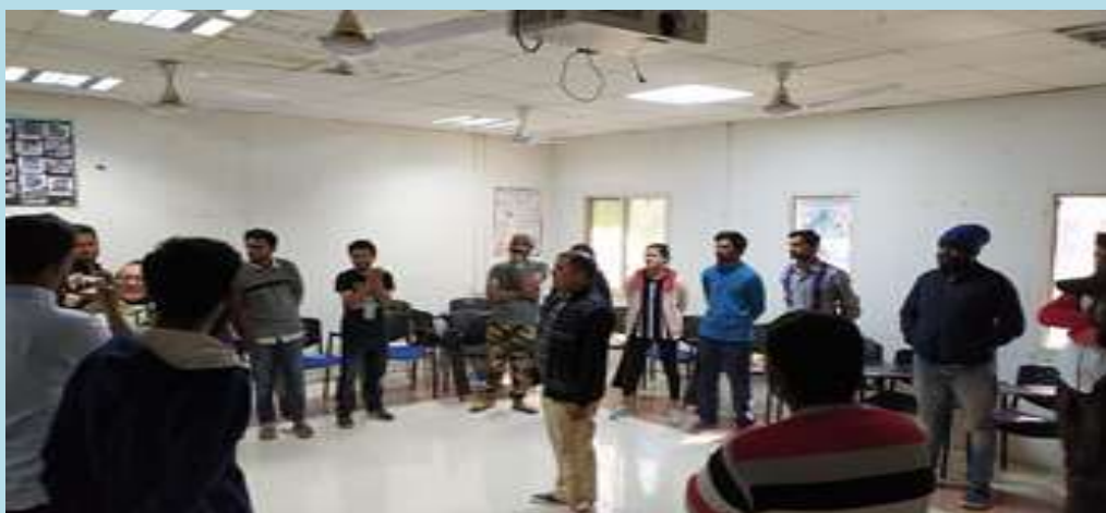
Group exercise as part of classroom learning