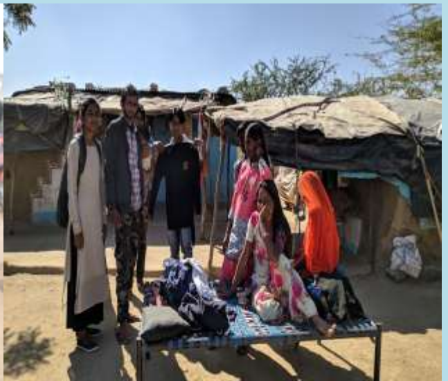
Students in the fieldwork in community