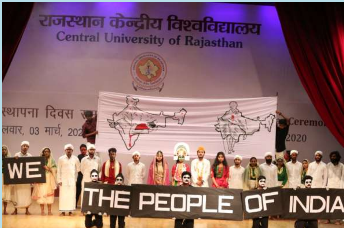
Students of Department of Social Work took part of the Foundation day programme of the Univesity