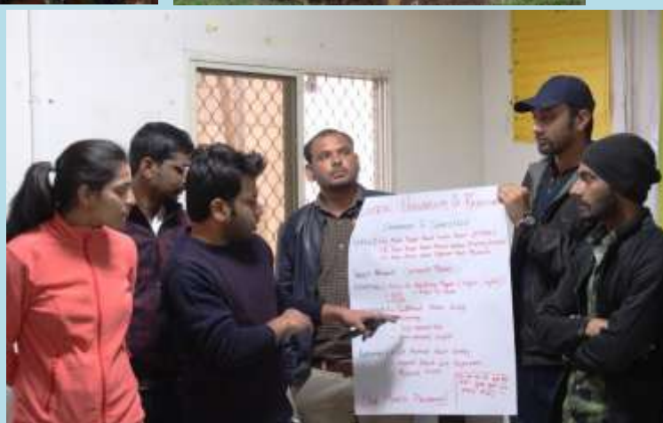
Various activities in the Department