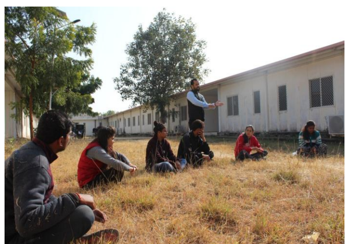
Skill Lab on Programme Media held on 12 th January 2019