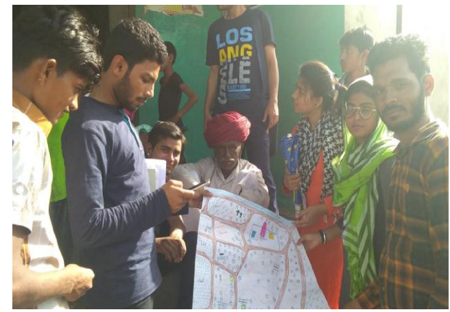
Fieldwork activities by the students of Social Work