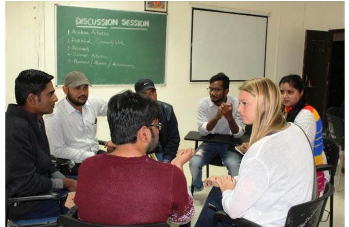
International Colloquium in collaboration with St Ambrose University, USA, on 11 th and 12 th January 2018