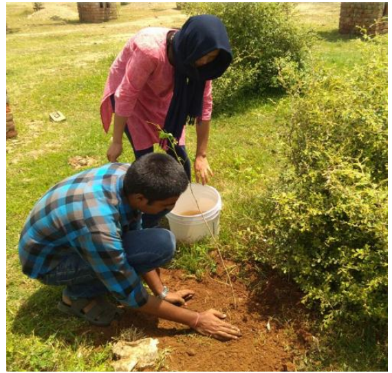
Poster presentation and plantation activity as part of theory and practicum in social work