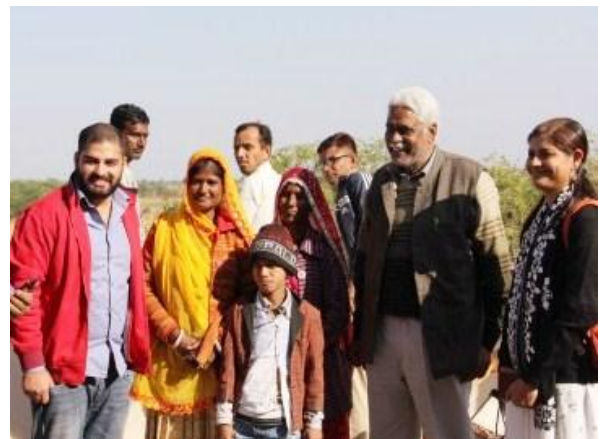
Human Rights Defender's Training in Collaboration with Action Aid Organized on 12 th -14 th December 2018