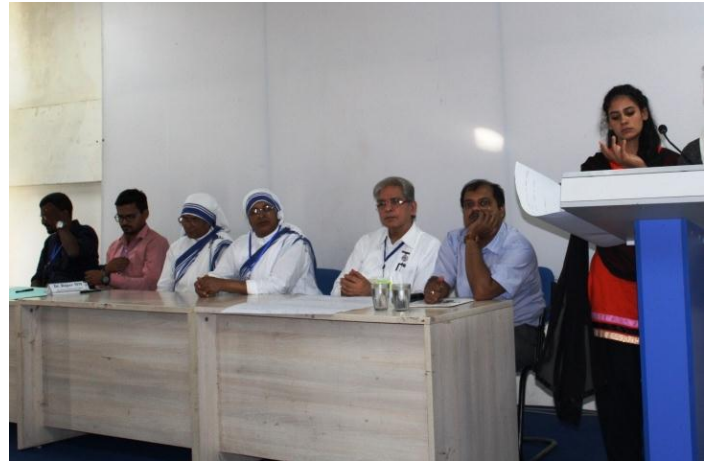
National Workshop on “Active Ageing in 21 st Century: Challenges and Opportunities among Multiple Stakeholders”, held on 27 th and 28 th October 2008