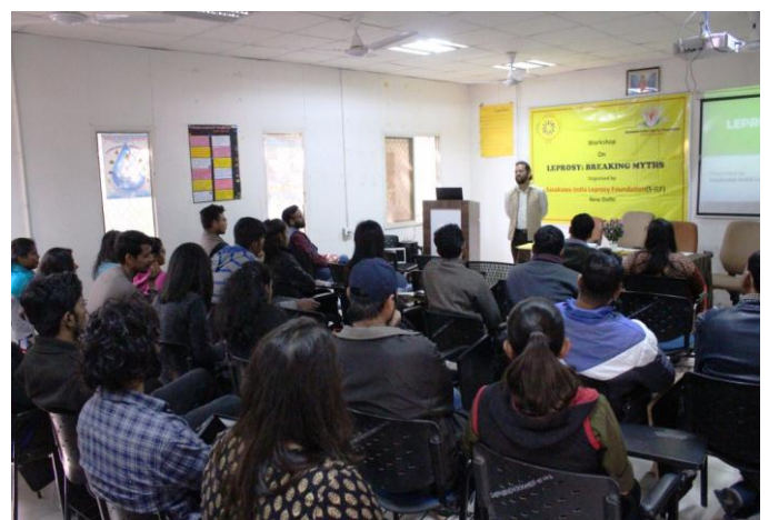
Awareness and sensitization programme on “Leprosy: Breaking the Myths” held on 11 th January 2019