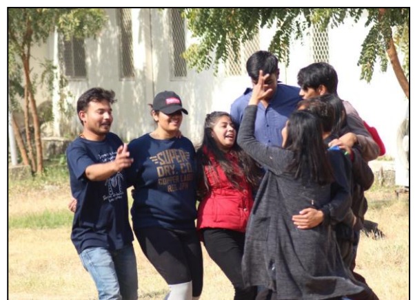
Students learning and performing Nukkad Natak