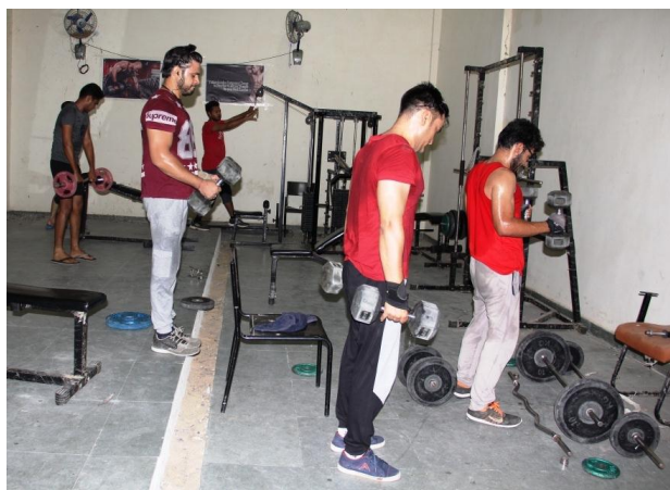
Facilities in the campus and Hostels