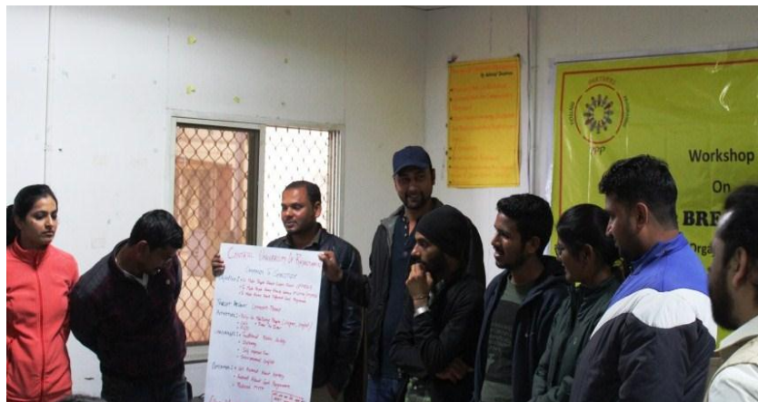
Group exercise as part of class-room learning